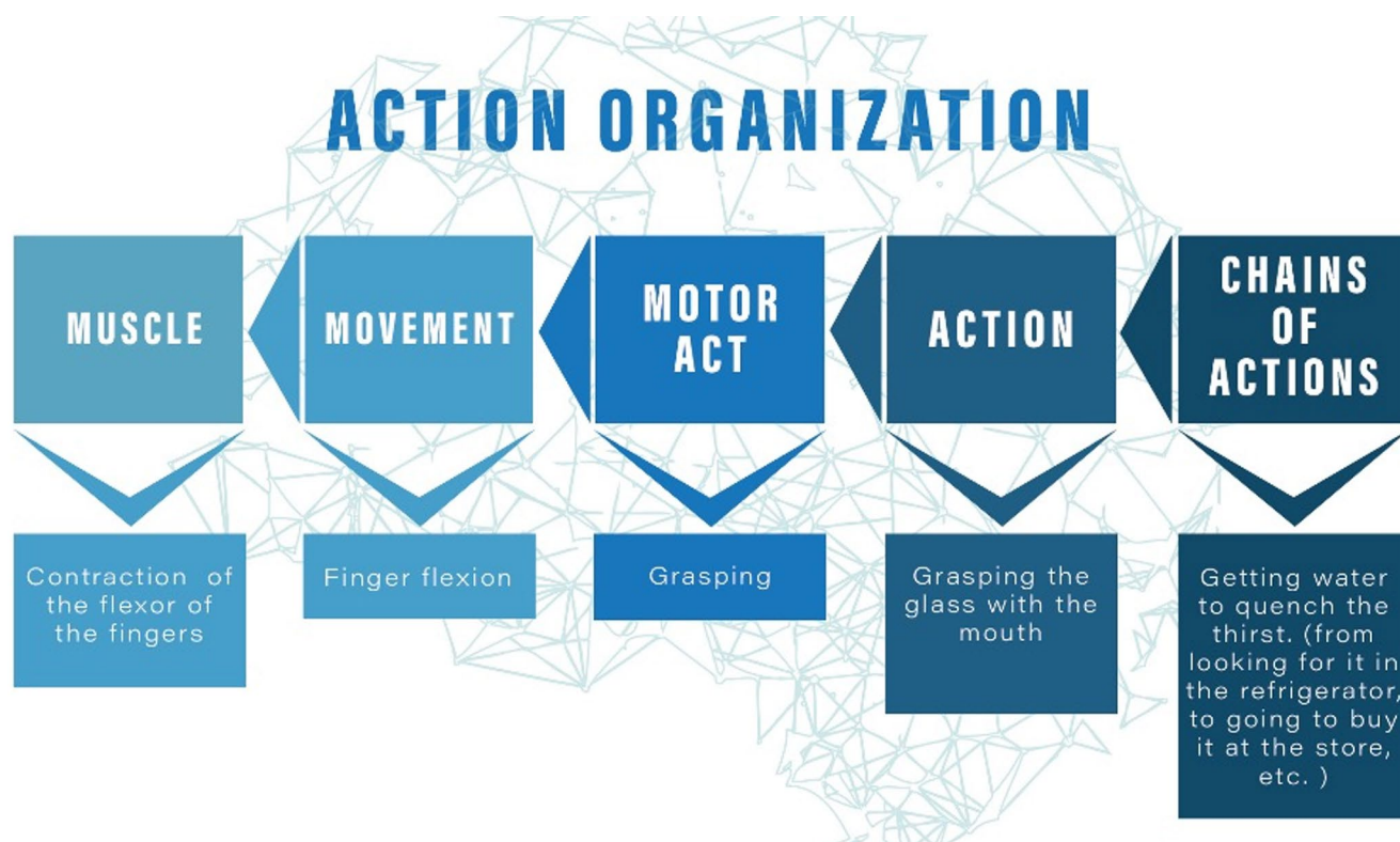
Fig. 2 Different hierarchical levels of action organisation and control

Action organisation necessarily requires mechanisms of sensorimotor transformation performed by several parieto-premotor circuits. These transformations allow individuals to choose the effectors and motor acts suitable to interact with space and objects of the external world. In this way, spatial information is transformed in oculomotor behaviour or reaching acts, depending on the target's distance from the individual. Similarly, object features (shape, size,